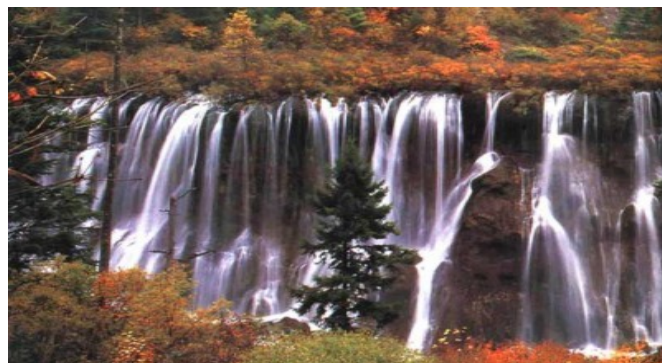
Jiuzhaigou stunning View

Day 8 Jiuzhaigou : We have a full day to explore and appreciate one of China's most beautiful national parks. We visit the numerous lakes. The park is a huge area of gorgeous alpine valley studded with dazzling turquoise lakes and surrounded by snowy peaks. Shuttle bus services take visitors around but many choose to walk/trek along the walkways and paths running alongside the rivers. There are basically two routes covering Jiuzhaigou and we will do certain selective scenic spot. ON Jiuzhaigou.