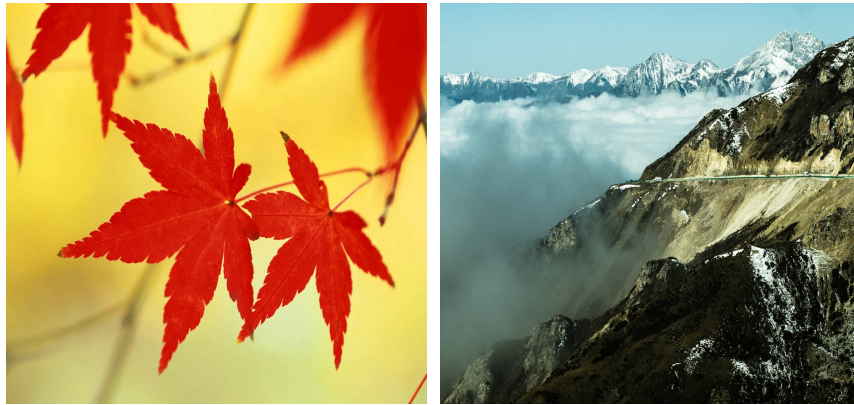
Way to Langmusi/ Jiuzhaigou

studded with waterfalls and travertine ponds of blue, yellow, white and green. The top temple is 7.5 km from the entrance and has the most beautiful pools. Cable cars are available for visitors to get quickly to the top. Then drive to Songpan. ON Songpan.