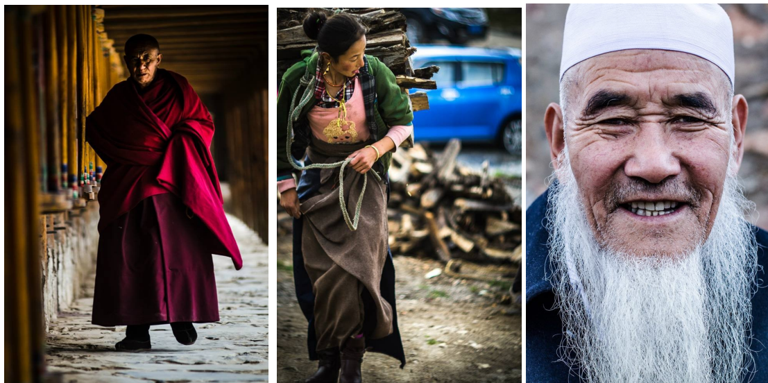
Tibetan/Hui People along the journey

Day 10 Songpan/Bipenggou Valley : Morning free & easy hang around the Ancient Songpan town and take a walk in the city. Afternoon drive to Bipenggou Valley. O/N Bipenggou Valley.