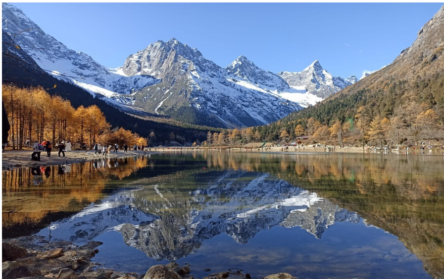
Bipenggou

IMPORTANT NOTICE: This is meant to be a "free and easy" adventure trip. Participants should be relatively fit, with a good sense of humor, and above all, have the right attitude for close travel with others through possibly some trying times. Most definitely, this is not a trip for prudes, whiners, fuss-pots, and other similarly assorted types! We had a couple of those before and it wasn't pleasant for us or them. Although every effort will be made to stick to the given itinerary, ground conditions may change and cause some disruption and/or deviation from the norm. Otherwise, have fun.