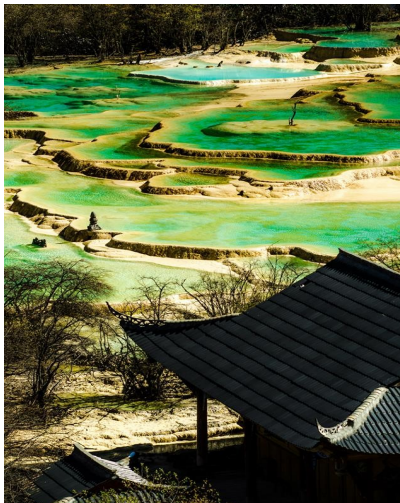
1st Bend of Huanghe river & Huanglong

Day 8 Jiuzhaigou : We have a full day to explore and appreciate one of China's most beautiful national parks. We visit the numerous lakes. The park is a huge area of gorgeous alpine valley studded with dazzling turquoise lakes and surrounded by snowy peaks. Shuttle bus services take visitors around but many choose to walk/trek along the walkways and paths running alongside the rivers. There are basically two routes covering Jiuzhaigou and we will do certain selective scenic spot. ON Jiuzhaigou.